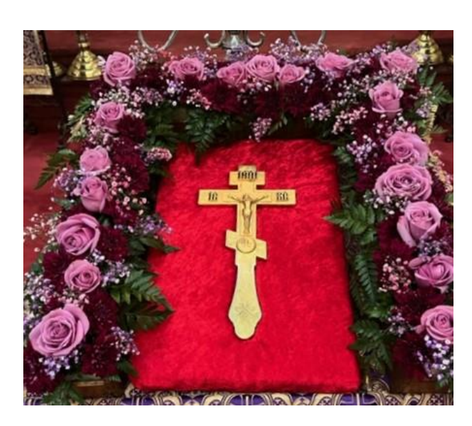
Beautiful job of the flowers by Debbie Rapaport